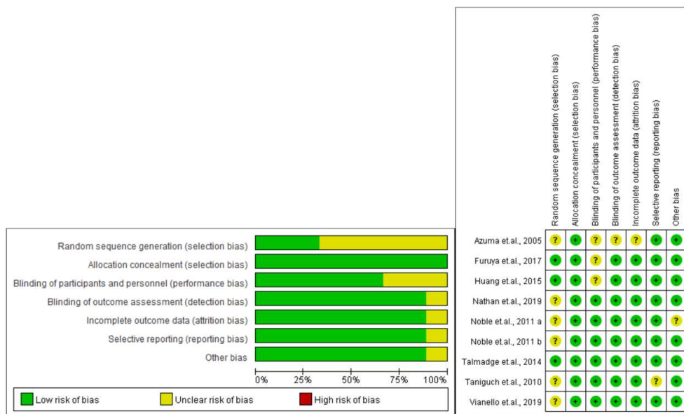
Supplementary Figure 2. Quality assessment of included studies.