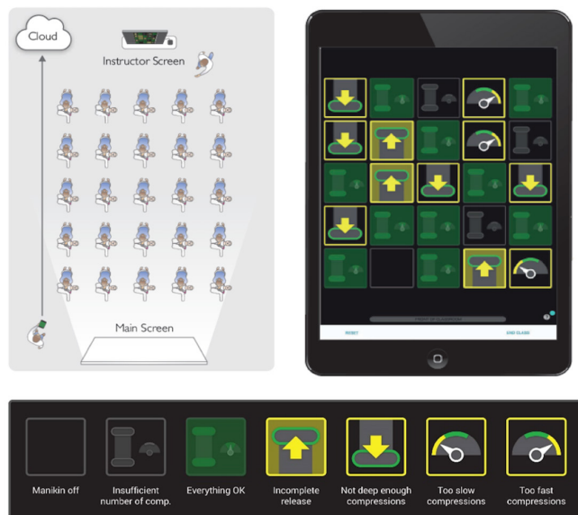
Figure 2 Image of Quality Cardiopulmonary Resuscitation-Classroom feedback system.

To measure the effect of CPR training, 1 min of chest compression was measured without any feedback given as a pretest. Similarly, 1 min of chest compression was also measured after the training as a post-test. Although 1 min of measurement may not be sufficient for CPR performance in real life, we focused on the initial CPR performance in a single-rescuer situation. A survey and baseline characteristics, such as weight, height and CPR training experience (table 1), were also collected after the post-training measurement. The metronome was set at 110 beats/min and used for every instance of hands-on practice during the QCPR Classroom session, but no metronome was used during the standard CPR training.