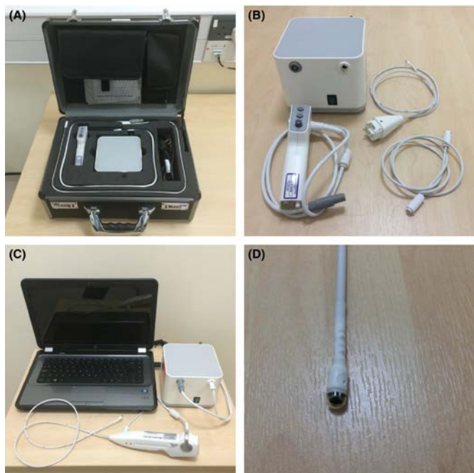
Figure 1 The EG Scan II system. (A) The portable case with four main parts; (B) the image processor (top left), disposable probe (top right), air tube (bottom right) and hand-held controller (bottom left); (C) the system connected and ready for use; (D) close view of the capsule probe tip.

Specific consent forms for these interviews were devised and confirmation of consent was obtained prior to each