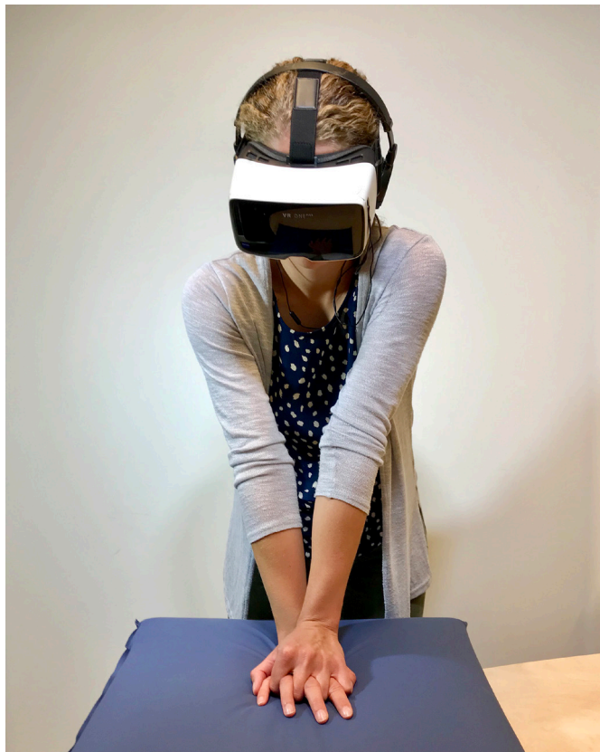
Figure 2 Lifesaver VR app. Demonstration of the Lifesaver VR setup, using headphones, VR goggles and a pillow to perform chest compressions. VR, Virtual reality.

report on other, secondary CPR quality parameters such as flow fraction (percentage of time where compressions given) and proportions of chest compressions with full release (as a measure for leaning), assessed with registrations of the certified CPR manikin. Finally, we will calculate proportions of participants meeting guideline CPR quality criteria. 10 26 27