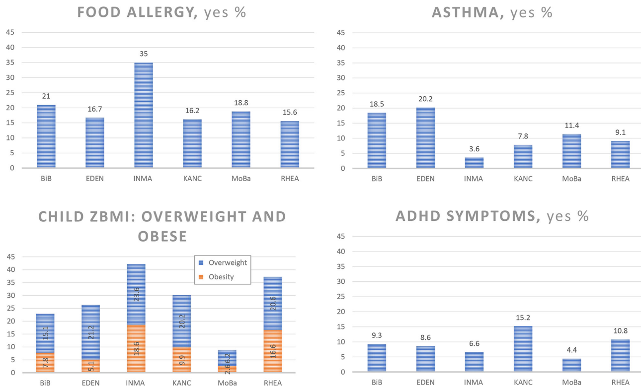
Figure 2 Prevalence of children with food allergy, asthma, overweight/obesity and ADHD symptoms in the HELIX subcohort at 6–11 years. BiB, Born in Bradford; EDEN, Étude des Déterminants pré et postnatals du développement et de la santé de l'Enfant; HELIX, Human Early Life Exposome; INMA, Infancia y Medio Ambiente; KANC, Kaunus cohort; MoBa, Norwegian Mother and Child Cohort Study; zBMI, age standardized z-score for body mass index.

children (using the age-and-sex-standardised z-scores) was highest in RHEA (37.2%) and INMA (42.3%) and lowest in MoBa (15.8%) (table 7, figure 2).