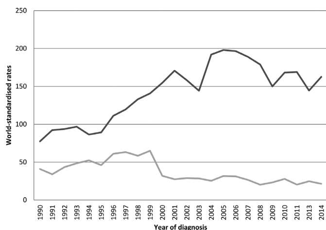
Figure 3 World-standardised incidence and mortality rates for prostate cancer in Martinique for the period 1981–2014 (excluding 2012). Dark grey line represents incidence; light grey line represents mortality.

For the Caribbean zone, data are sparse, particular for countries that do not have a cancer registry and are based primarily on estimations and projections. Recording cancer data in cancer registries is essential for the production of reliable epidemiological data, and also contributes to improving management and reducing mortality. 38 39 Countries with limited resources, such as island states in the Caribbean, have high mortality, yet do not all have population-based cancer registries to evaluate the extent of disease. It would therefore be beneficial if other existing registries could contribute to the production of international epidemiological statistics for this area. 38 40 A multicentre study on QoL in patients with PCa