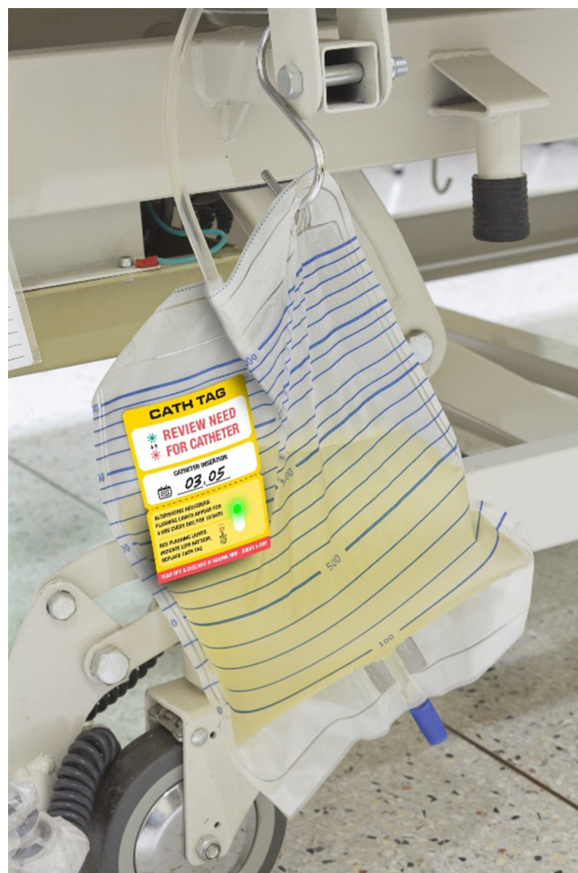
Figure 2 The CATH TAG attached to a catheter bag.

Eligible wards in the hospital will be randomly assigned to cross over to the intervention every 4 weeks over the trial duration of 24 weeks. If no clustering, the sample size for 80% power at 0.05 significance would be 816. Allocation of wards to the intervention will be concealed. Computer-generated randomisation of the crossover dates for the wards will be performed independently by one of the investigators, who will not be involved in assessment or delivery of the intervention. All included wards will be provided with sufficient notice of the dates to cross over