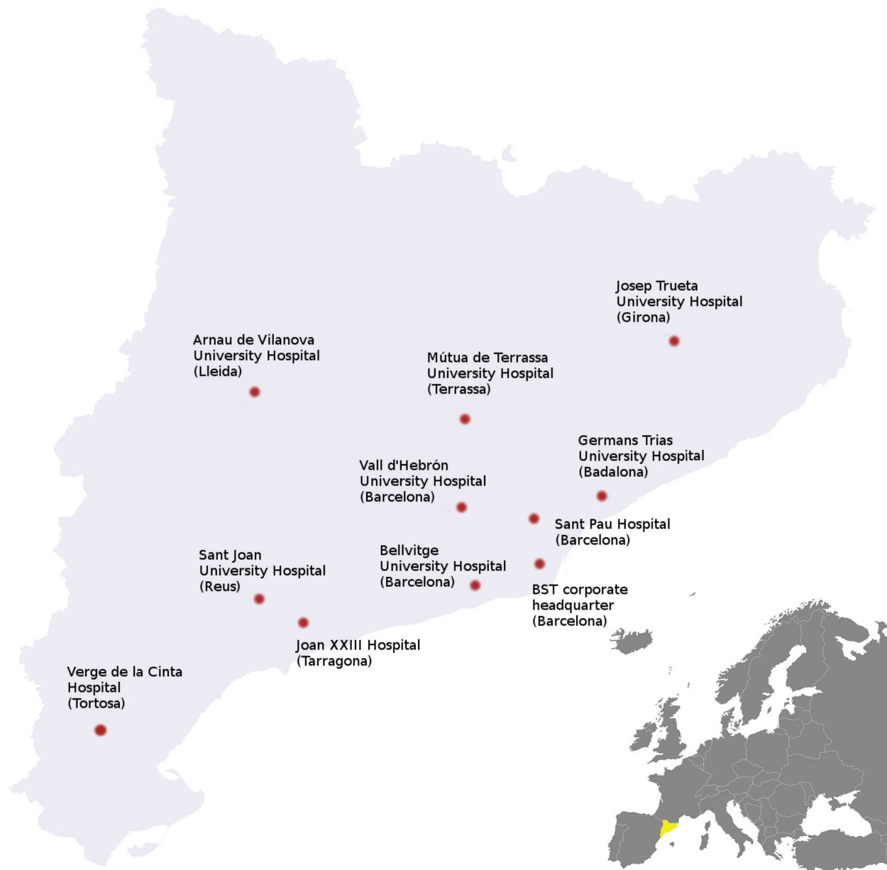
Figure 1 Genomes for Life (GCAT) recruitment centres. Distribution of the 11 GCAT permanent recruitment centres across the Catalan territory.

appointment by phone or via our GCAT web page after filling in a registration form. All participants who agree to be part of the study provided an informed consent and are asked to sign a consent agreement form that allows permission to access electronic health records (EHRs) for passive follow-up and to be contacted regularly to collect follow-up information collection on lifestyle and disease events. Participants are free to leave the study or withdraw their consent for specific areas of research.