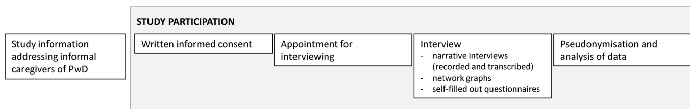
Figure 3 Overview of study participation. PwD, persons with dementia.

to or from the research department, and travel costs are repaid. In general, it is important that the interviews will be undisturbed; that is, a meeting room is reserved, and colleagues are asked for consideration. If study participants wished to be interviewed as a couple or a group, we would accept this; however, our intention is that each study participant should have the equal opportunity to respond freely. If study participants did not wish to visit the research department or to be interviewed at home, we would also arrange interviews via telephone or Skype. We calculate that each narrative interview will last 1–2 hours followed by answering the questionnaire. To diminish the study participants' burden, it is possible for them to complete the questionnaires later. In this case, the main researcher (LN) will give them a stamped envelope accompanied by a reminder to contact her if any questions arise while completing the questionnaire. For this, we originally estimated a duration of 30–45 min, but we observed shorter periods in some pretests. Each study participant will receive an expense allowance (ie, a sum of money in euros) after completing both measurements.