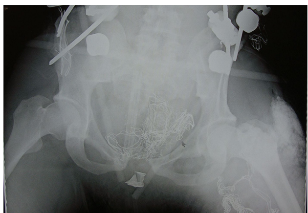
Figure 3 X-ray taken for placement of a pelvic external fixator showing: disruption of pelvic ring by the force of an antipersonnel improvised explosive device. The arrow indicates combat gauze packing a severe perineal injury; silica laden soil injection by the explosion.

In collecting information on 100 consecutive patients, we hope to have described a generalisable result. Due to the nature of the conflict and the local culture, all of the