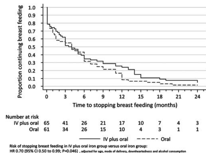
Figure 3 Effect of IV plus oral iron versus oral iron on rate of cessation of breastfeeding.

Another finding of our study was an association between male gender babies and an unfavourable mental health component outcome for participant women across the two groups. Of the seven component