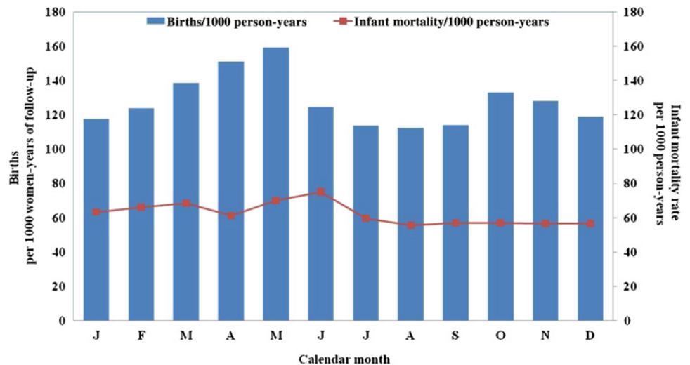
Figure 2 Births and infant mortality per 1000 person-years, by calendar month.

of maternal multiple micronutrient supplements. 24 25 The results also concur with those of our main paper, which reported no effects of vitamin A supplementation in women of reproductive age on maternal mortality and