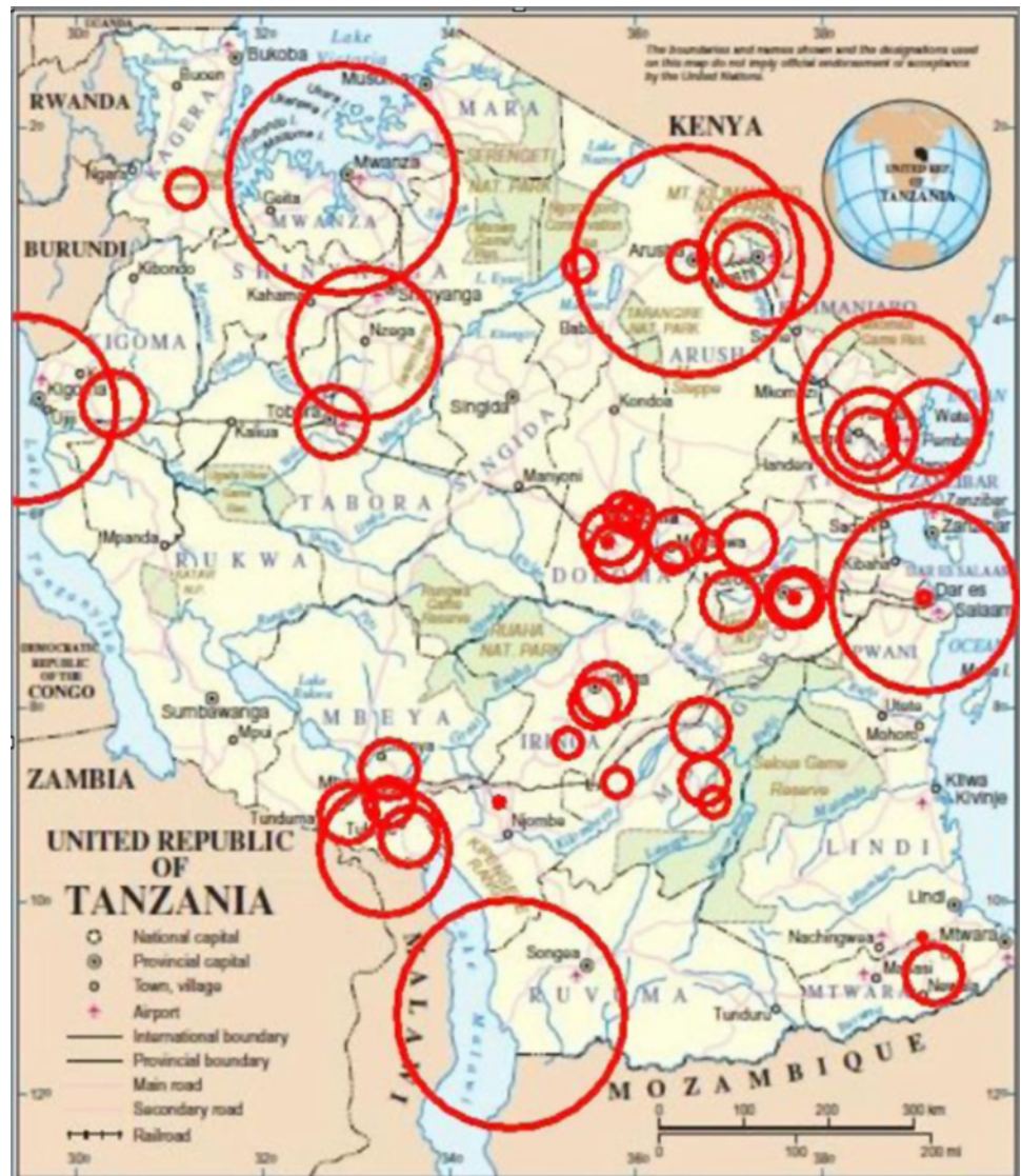
Figure 1 Facilities evaluated. Ring size proportional to population served.

low-income countries for patients with surgically treatable conditions. An estimate of the global burden of surgery showed that only 26% of estimated surgical procedures were performed in low-income countries, despite these countries accounting for 70% of the global population. 2 Of the estimated 536 000 maternal deaths in 2005, developing countries accounted for 99% of these deaths 6 ; much of this mortality could be prevented by timely access to emergency and basic surgical services.