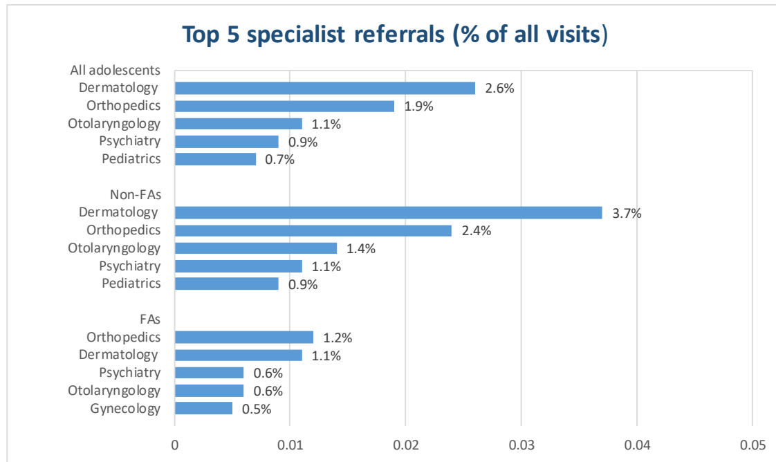
C: Top 5 specialist referrals