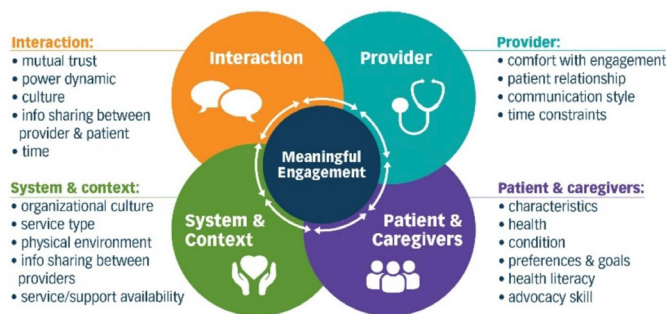
Figure 1 Four domains to support patient and caregiver engagement in clinical decision-making.

The theoretical framework guiding this work was previously developed by Stolee et al and Elliott et al , who conducted a realist synthesis on patient and caregiver engagement in healthcare decision-making—the Choosing Healthcare Options by Involving Canada's Elderly (CHOICE) project. 21,22 The framework (see figure 1) is comprised of four main domains to support meaningful engagement: the patient and caregivers, healthcare provider (HCP), interaction/relationship and consideration of the broader healthcare system. Central