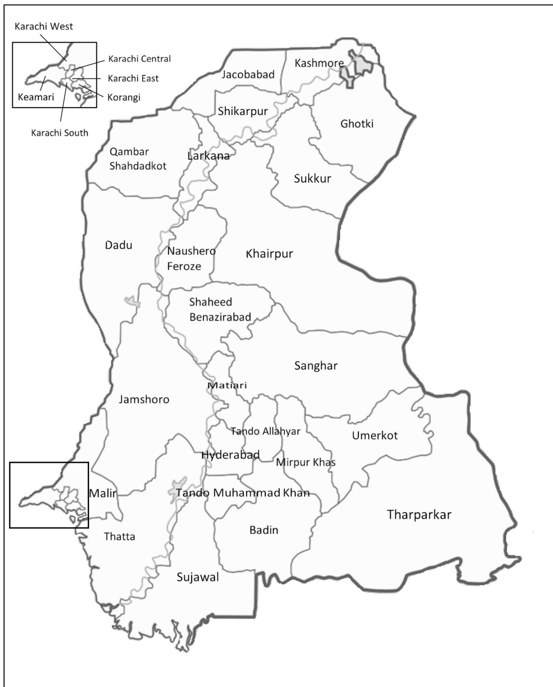
Figure 1 Districts of Sindh province.

hospitals. This is as an initial step, and we plan to use this information later to get funding and further details on other aspects.