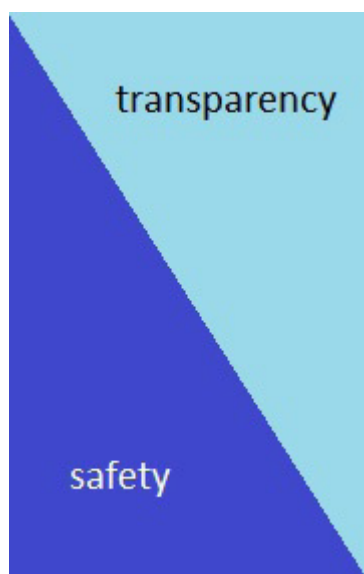
Figure 2 Transparency versus safety for learning.

Sustainable quality improvement depends on health professionals feeling safe enough to learn. At the same time, it is necessary for doctors to realise the importance of offering society insight into their daily practice and