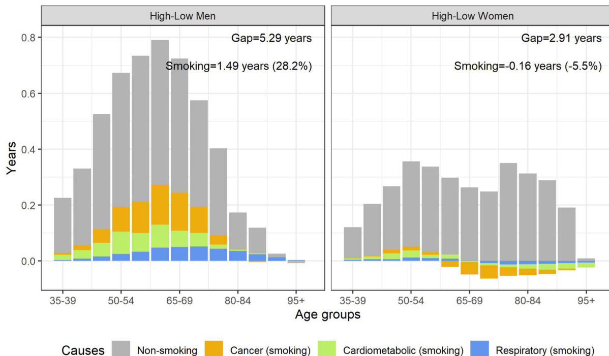
Figure 2 Age and cause-specific contributions of smoking-related mortality and non-smoking related mortality to educational inequalities in life expectancy at age 35 between high-low educational level groups by sex, Spain 2016–2019.

the smoking epidemic model. 32 33 In Spain, women started to smoke 30 years later than women in other high-income countries (eg, the UK or the USA) mainly due to contextual factors, that is, political, social and economic transformations including women's participation in the workforce and access to tertiary education did not really accelerate until after the Franco dictatorship (1939–1975). For instance, when a decline in smoking among college students started in the USA around the 1970s, higher educated women in Spain started to smoke. Our findings are consistent with Haeberer et al 22 who found that Spanish women aged 55 years and over with high socioeconomic status showed higher smoking-related mortality. As Wensink et al 34 point out, the continuous increase in smoking-attributable mortality in older women cohorts remains a cause for serious concern.