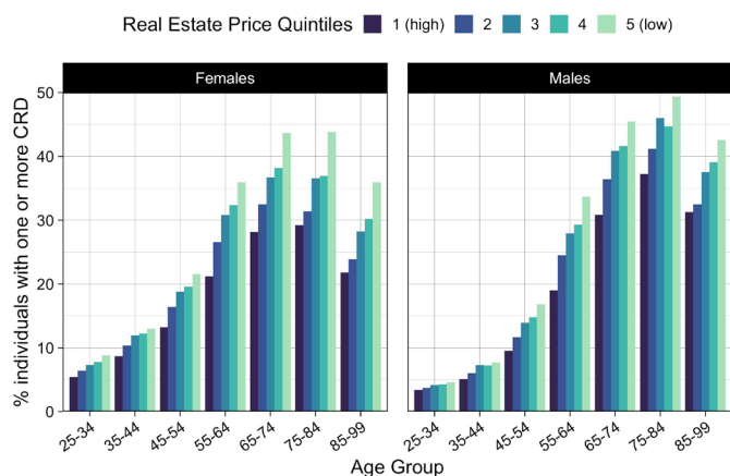
Figure 2 Percentage of individuals with chronic or rare disease (CRD) by age, sex and real estate price quintiles.

Table 2 shows the results from logistic regression implemented to identify the association between the two measures of SEP and the presence of chronic or rare diseases on the census reference day. Age-adjusted and sex-stratified OR are reported with 95% CI. Educational attainment had a clear negative gradient, both medium and low educated people, either female or male, are shown as more likely to have at least one chronicity than