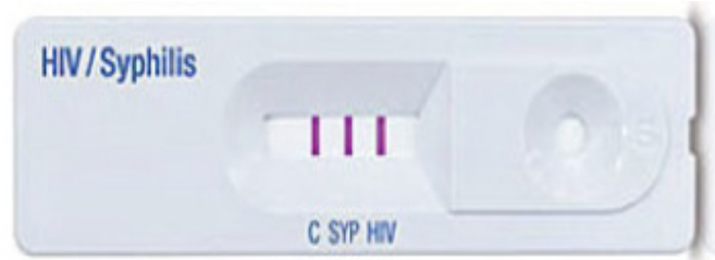
Figure 2 Bioline point-of-care test.

on themselves believing that the test is accurate and convenient. In turn, if acceptability and usability are high among both providers and users, then implementation is feasible.