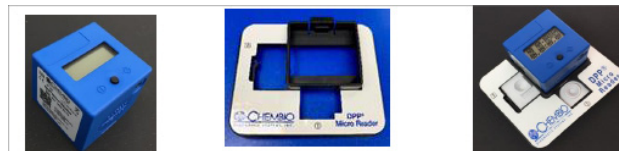
Figure 4 DPP microreader, test device holder, DPP microreader with test device holder and test device. DPP, dual path platform.

Recently, the Chembio Company developed the DPP microreader (MR) to complete the Chembio DPP technology and minimise error due to subjective visual interpretation (figure 4). The DPP MR is a portable, battery-powered instrument that uses assay-specific algorithms to analyse the test and control line reflectance to determine the presence or absence of the antibodies to HIV and/or TP in the sample. The device is fitted to the Chembio POCT via a dedicated holder. The reader verifies the presence of the control line and measures colour intensity at each of the test line positions; it interprets the results using an algorithm including assay-specific cut-off values, and reports a positive, negative or invalid result. 20