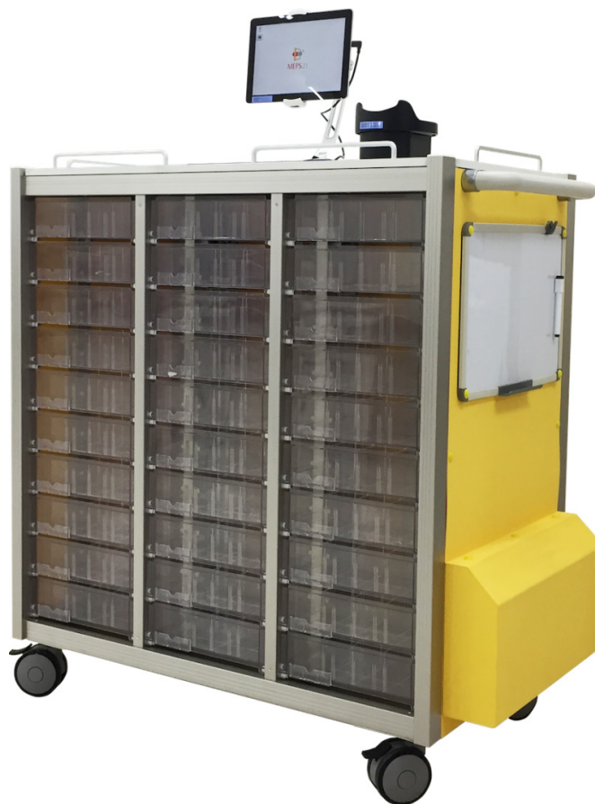
Figure 2 The photograph of the new cart.

The aim of this study was to evaluate the efficacy of a medication cart equipped with a palm vein authentication system for reducing drug administration errors in psychiatric hospitals.