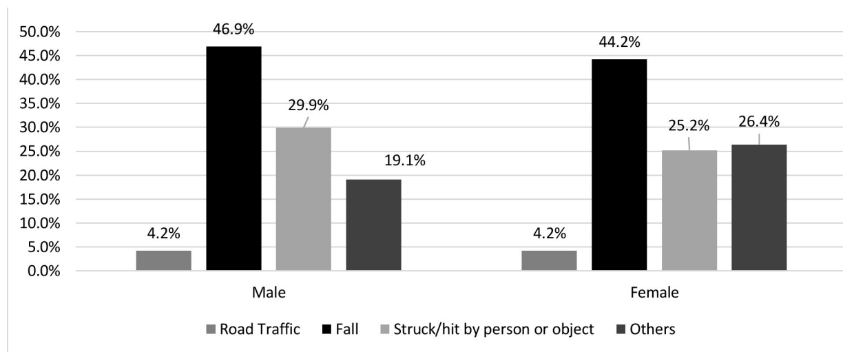
Figure 2 Distribution of the mechanism of injury by gender

child active supervision to protect children as a vulnerable population as well as underlines the importance of securing built-in child safety in the surrounding environment (eg, locked cabins, gated stairs) that prevents and reduces childhood injuries. This study demonstrates that unintentional injuries had a large toll on children, particularly those less than 5 years of age compared with their older counterparts. Nonetheless, it is worth noting that intentional injuries are under-reported in the Lebanese society, particularly with the lack of adequate policies or laws to protect children from any forms of abuse. As a result, hospitals are constrained from reporting abuse even if observed during evaluation.