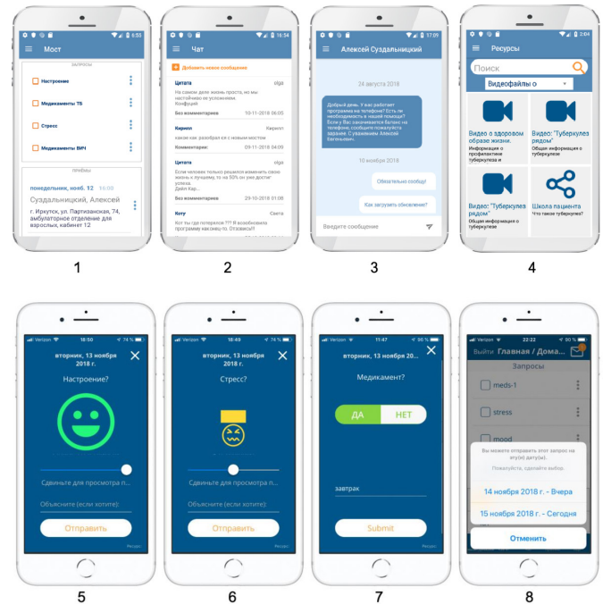
Figure 1 MOCT (Russian, ‘bridge’) platform features following adaptation. MOCT platform includes a dashboard (1), a community message or ‘CHAT’ board (2), direct provider messaging (3), educational/community resources (4), daily queries of mood (5), stress (6), adherence to HIV/TB medications (7), appointment and medication reminders (8) and HIV/TB lab results. TB, tuberculosis.

A total of 60 patients were enrolled in the pilot study. Briefly, in terms of usage of the app in the first six months, 51 (85%) logged in at least once, and 43 (72%) actively used an interactive feature, including responding to daily queries, private messaging or posting to the ‘chat’ board. The cohort and additional usage details are described elsewhere. 28 Patients’ perceptions of the platform’s usability and acceptability were assessed following 6 months of participation in the intervention (table 2). The survey was completed by 47 participants (seven patients were lost to follow-up, two were deceased by six months, one did not attend the 6-month assessment and three attended the assessment but did not complete the survey). Categories of survey questions were grouped as follows: (1) Impact, (2) Perceived Usefulness, (3) Perceived Ease of Use and (4) User Control. On average, patients scored the platform above 4 on a scale from 1 to 5 (5=strongly agree) for all but two survey items. The lowest scored items were both related to the perceived usefulness of the platform in facilitating ‘quicker’ or ‘more timely’ self-management of HIV-related symptoms.