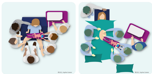
Figure 3 Position of the Concord birth trolley. The Concord birth trolley is positioned at the left side of the mother. The infant is then stabilised while the umbilical cord is still intact. The Concord birth trolley is fully equipped for stabilisation of infants that are born with a congenital diaphragmatic hernia.

three and ten minutes after birth, respectively. 29 At any time, the attending neonatologist and obstetrician can decide that PBCC should not be performed or be interrupted. In that case, the infant can be placed on the standard resuscitation table for (further) stabilisation. In this trial, physicians cannot be blinded to treatment allocation. However, we believe that the lack of blinding will not lead to deviations from the intended intervention, hence the influence on the primary outcome will be limited. In the immediate cord clamping group, the cord will be clamped immediately after birth. The infant will then be transferred to the standard neonatal resuscitation table. Thermomanagement during stabilisation is an important focus in both groups since hypothermia is a known trigger for pulmonary hypertension. Normal precautions will be taken to prevent heat loss, such as dry towels, caps, and a radiant warmer. After cord clamping, all infants will be managed according to the standardised neonatal management protocol for infants with a CDH, which is a consensus of current clinical guidelines by the CDH EURO consortium. 19 A 2D echocardiography will be performed within the first 24 hours of life to evaluate the presence or absence of pulmonary hypertension.