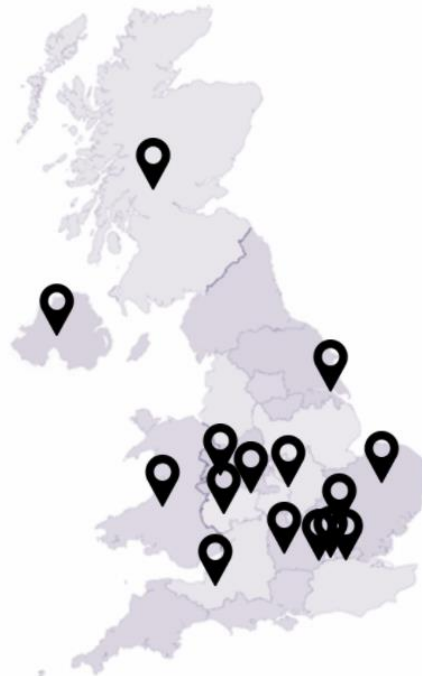
Figure 1. Geographical reach of deaneries by participants in this study.