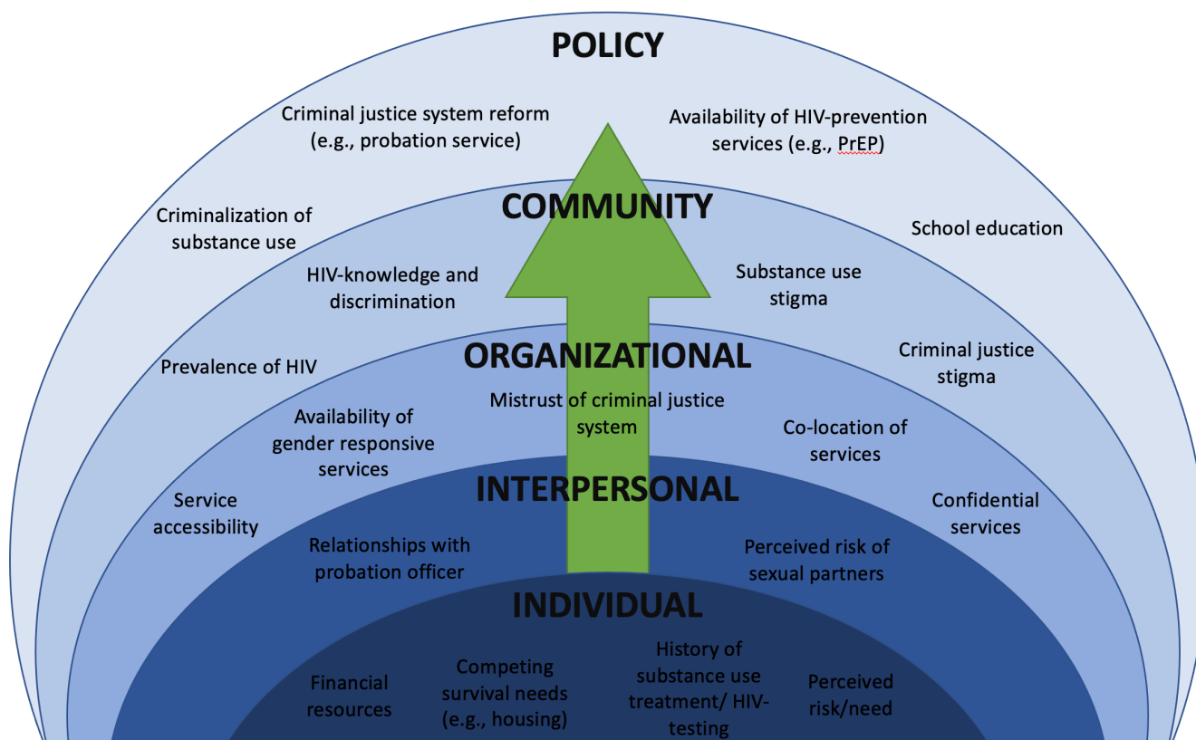
Figure 1 Contextual factors shaping HIV-prevention and substance use treatment service implementation for young adults involved in the criminal justice system as guided by the Social Ecological Model. PrEP, pre-exposure prophylaxis.

negative impact that alcohol use was having on their life when stating: