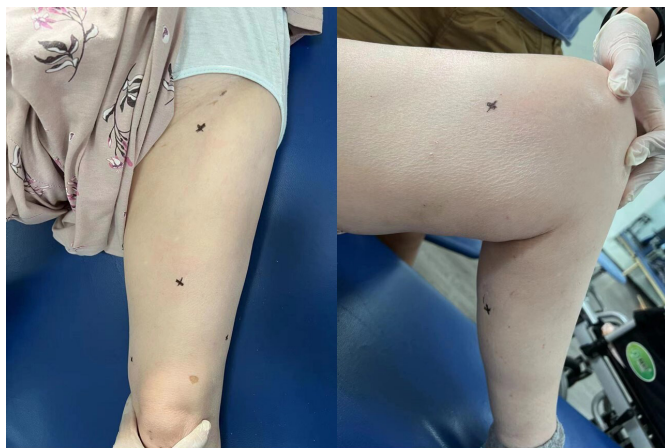
Figure 2 Treatment sites. (A) Myofascial trigger points (MTrPs) on the quadriceps of the lower extremity. (B) MTrPs on the gastrocnemius of the lower extremity.

independent statistician who does not know the allocation will analyse the data.