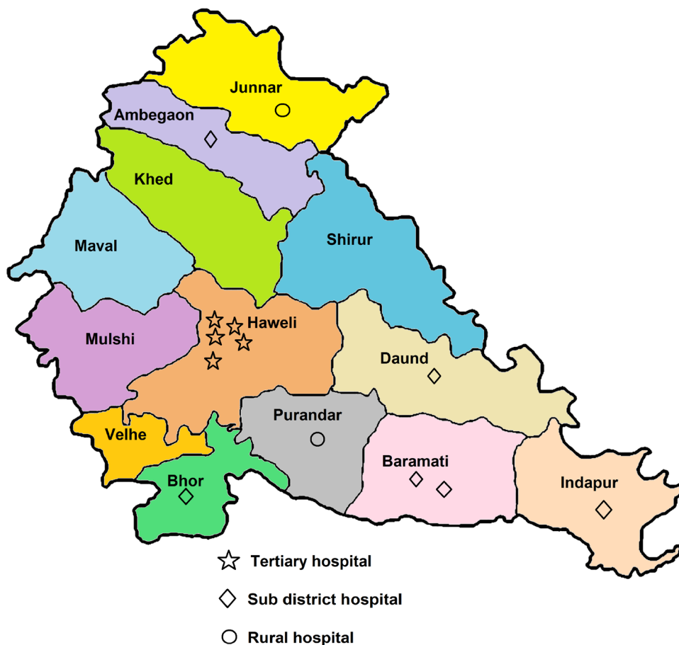
Figure 1 Block and type-wise participating hospitals in Pune, India, 2017–2018.

information from records and the remaining part by face-to-face interviews. They again interviewed the women during follow-up visits, and responses were recorded