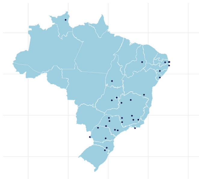
Figure 1 Geographical distribution of the 30 intensive care units in Brazil participating in the TELE-critical Care verSus usual Care On ICU Performance trial.