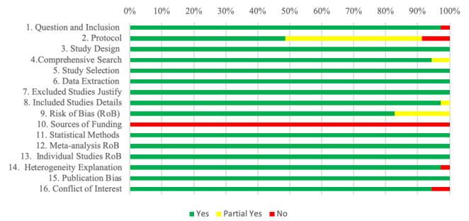
Figure 2 Overall critical appraisal of the included studies using the AMSTAR 2 tool.

NA, not applicable; N, no; P,Y, partial/yes; Y, Yes.