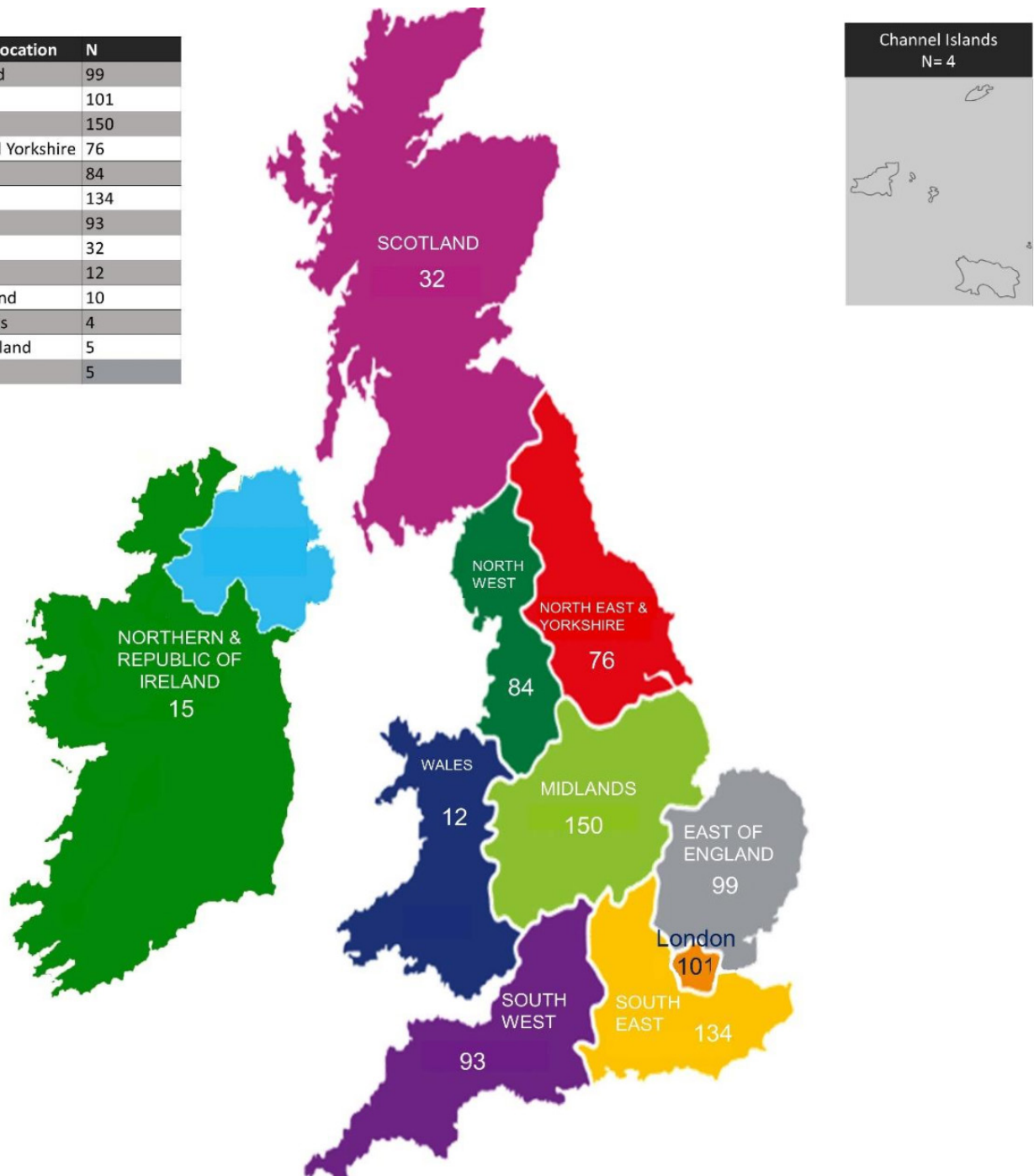
Figure 1 Geographical location.

additional ethical and privacy considerations of online and remote work.