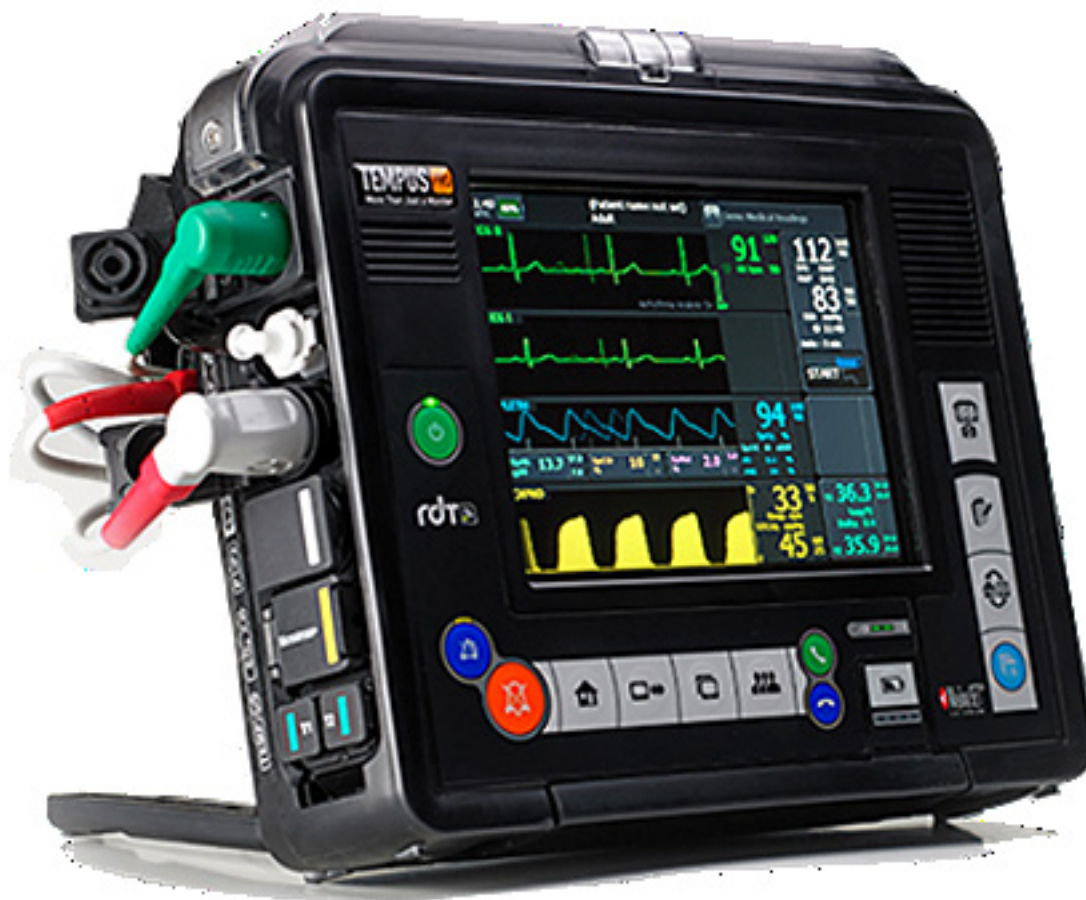
Figure 3 Image of Tempus pro monitor.

ED nursing staff and the capacity of this hospital is updated automatically (figure 2). On arrival at the ED, cardiac assessment is based on in-house clinical decision rules as guidelines prescribe, 12-lead ECG and laboratory findings. 9