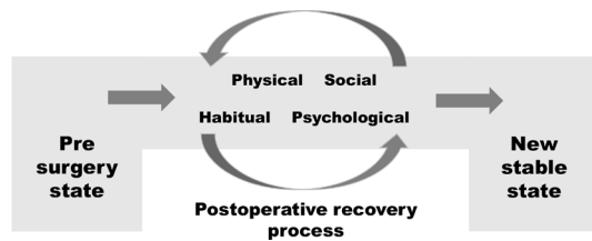
Figure 1 The process of postoperative recovery.

with a ‘new stable state’ (figure 1). Postoperative recovery is an individual process and a transformative journey, including how the physical, psychological, social and habitual dimensions affect each other in a continual and dynamic process that leads to a new stable state. This new stable state is not necessarily a state that is the same as that before surgery, or a return to presurgical functions. In many cases, the surgery itself was done to improve mobility and to reduce or remove dysfunctions. For example, some participants described how they were now able to do activities that were impossible before the surgery. For these participants, the new stable state was experienced as being more functional than the preoperative state. In other cases, such as when patients could not return to work, the new stable state involved adjusting to a state with a permanent decrease in or loss of preoperative functions.