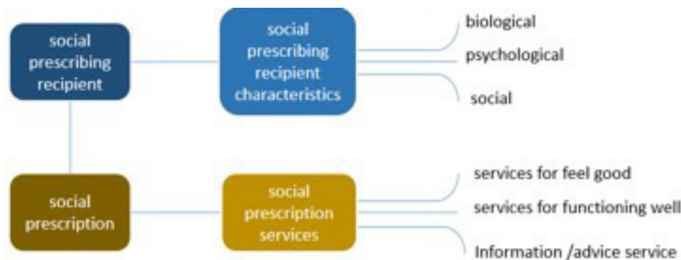
Figure 1 Upper level design of the social prescribing ontology.

concepts associated with social prescribing practices and the well-being of social prescribing recipients. The primary purpose of the taxonomy and ontology is to harmonise data sources containing measures and indicators of social prescribing across various parts of the health system (figure 1).