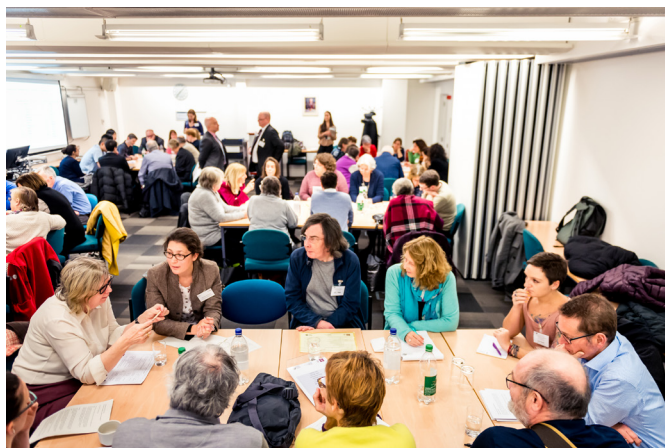
Figure 2 The Dragons’ Den session under way, showing the layout of the room used.

As epidemiologists, we try not to forget that each data point represents a person, but we need to re-examine whether we are asking the right questions of the