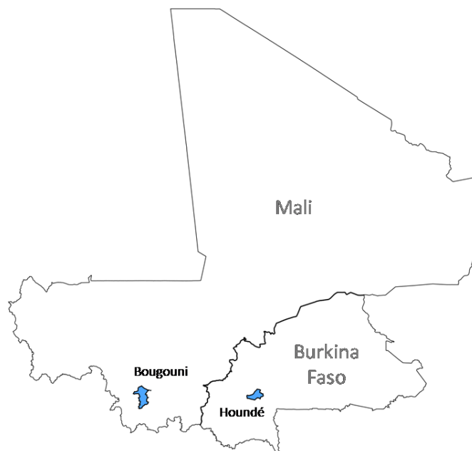
Figure 1 Study districts in Mali and Burkina Faso.

This is an individually randomised, double-blind, placebo-controlled trial with three groups. The trial will be conducted and reported according to Consolidated Standards of Reporting Trials guidelines. 12