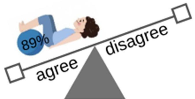
Figure 2 Perceived knowledge of the basic principles of Evidence-based Practice: patients' values, clinical expertise and scientific literature. EBM, Evidence-based Medicine.

In your opinion, the scientific literature is useful in your clinical practice? (item 20)