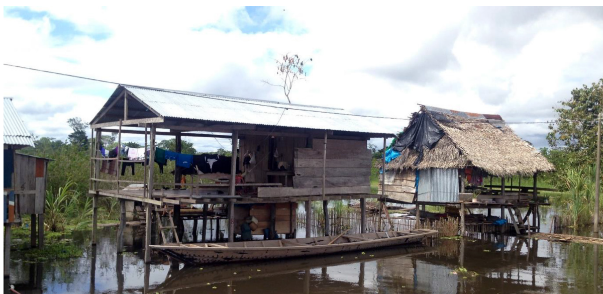
Figure 3 Wooden housing in the Peruvian Amazon during high river levels (photo credit: Stefan Reinders, 2017).

A 2-year programme evaluation with repeated household censuses and an in-depth mixed methods process evaluation is currently undertaken within a well-characterised study area. MDR is implemented in the rural areas of three districts ( Nauta , Parinari , Saquena ) in Loreto, covering 79 predominantly native communities of Kokama-Kokamilla ethnicity with a population of 14 474, almost half (44%) between 0 and 14 years old and 10% above 60 years of age. Communities are physically separated settlements dispersed along 350 km of the Amazon river or its subsidiaries (figure 2) within dense tropical rainforest and difficult access by boat only. Villagers live