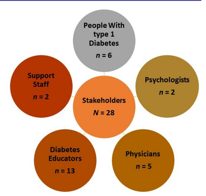
Figure 1 Stakeholder groups that informed the design of the study.

Second, the design was refined by the key intervention stakeholders, including (1) individuals with lived experience of T1D, hypoglycaemia unawareness and an earlier version of the HARPdoc, namely, DAFNE-HART (this is the patient and public involvement group for the study or people with diabetes (PWD) group) and (2) healthcare professionals (HCPs) involved in the delivery of the interventions under investigation. The stakeholders critically reviewed for relevance, feasibility and clarity a selection