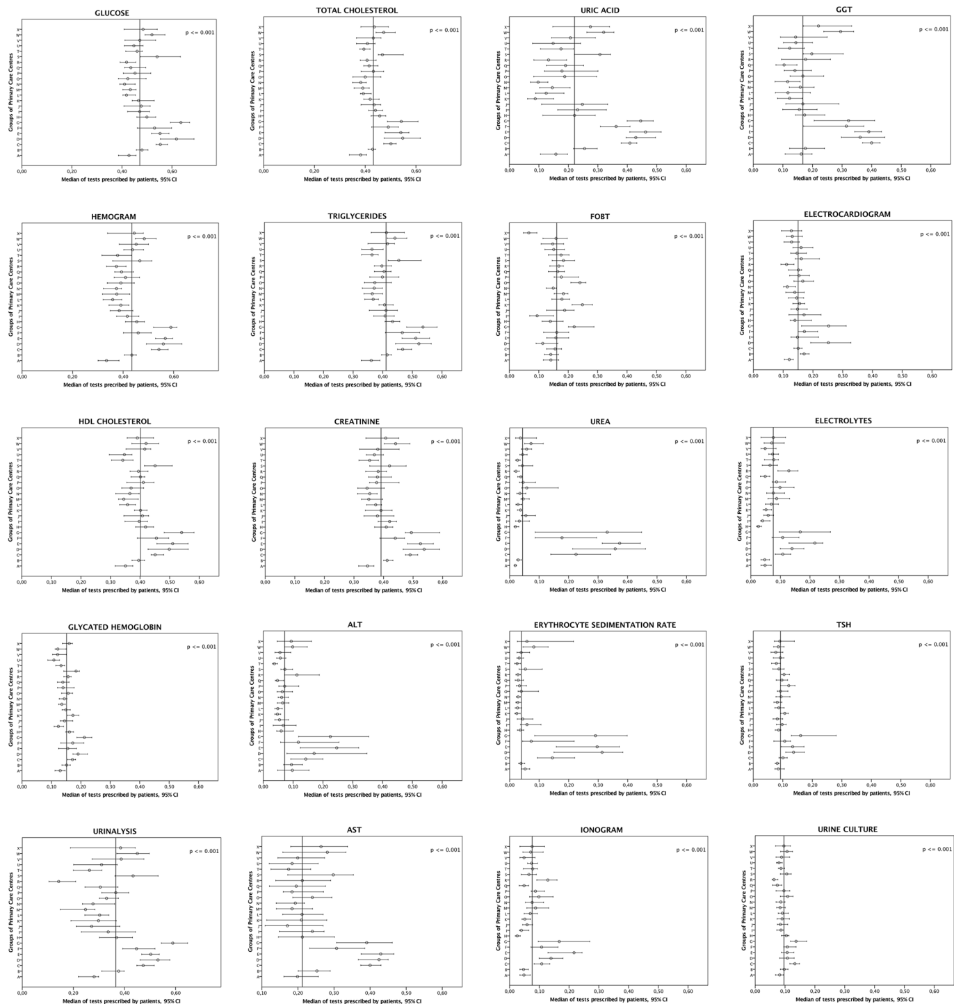
Figure 2 The 20 most ordered diagnostic and laboratory tests by Groups of Primary Care Centres and by patient.* ALT, alanine aminotransferase; AST, aspartate aminotransferase; ESR, erythrocyte sedimentation rate; FOBT, fecal occult blood test; GGT, gamma-glutamyl transferase; TSH, thyroid-stimulating hormone. *The Kruskal Wallis test was used. Medians and respective 95% CI were presented.

Other studies show lower values, and the Eurosentinel Study Group showed a mean of 1.6 to 4.1 tests per ‘user patient’ (4.1 in Portugal). 118 We think that some of these data were appropriately requested to monitor chronic diseases and colorectal cancer screening, which is increasingly performed by family physicians, such as lipid and glycaemic profile, creatinine, microalbuminuria and