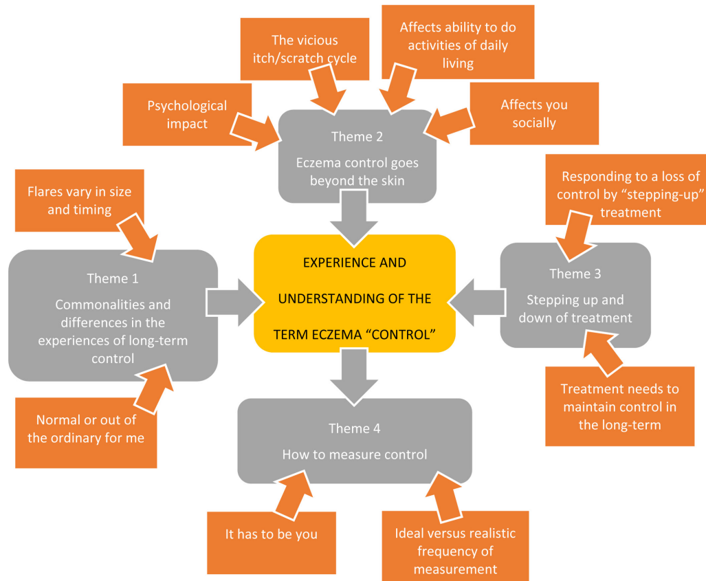
Figure 2 Mapping of the thematic framework.

If I catch a minor flare quickly enough I can sometimes control the irritation before it get completely out of control to what I call a meltdown. (Participant 5, group 1, female, aged 20 years)