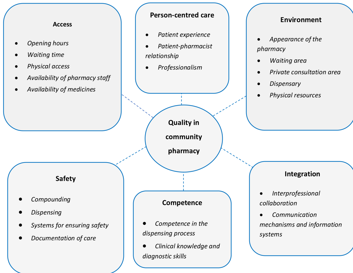
Figure 2 Overview of quality dimensions emerging from the literature.

Patients, pharmacists and GPs highlight the importance of pharmacies maintaining adequate stock and/or being able to obtain medicines quickly, to avoid patients having to return. 26 30 59 Patients also perceive reasonable and affordable cost of medications and notification of discounts as an important determinant of CP service quality. 53 58 70 83 85 88 89 91 93 97 Patients expect pharmacists to provide them with information about alternative medicines and their prices. 96 97