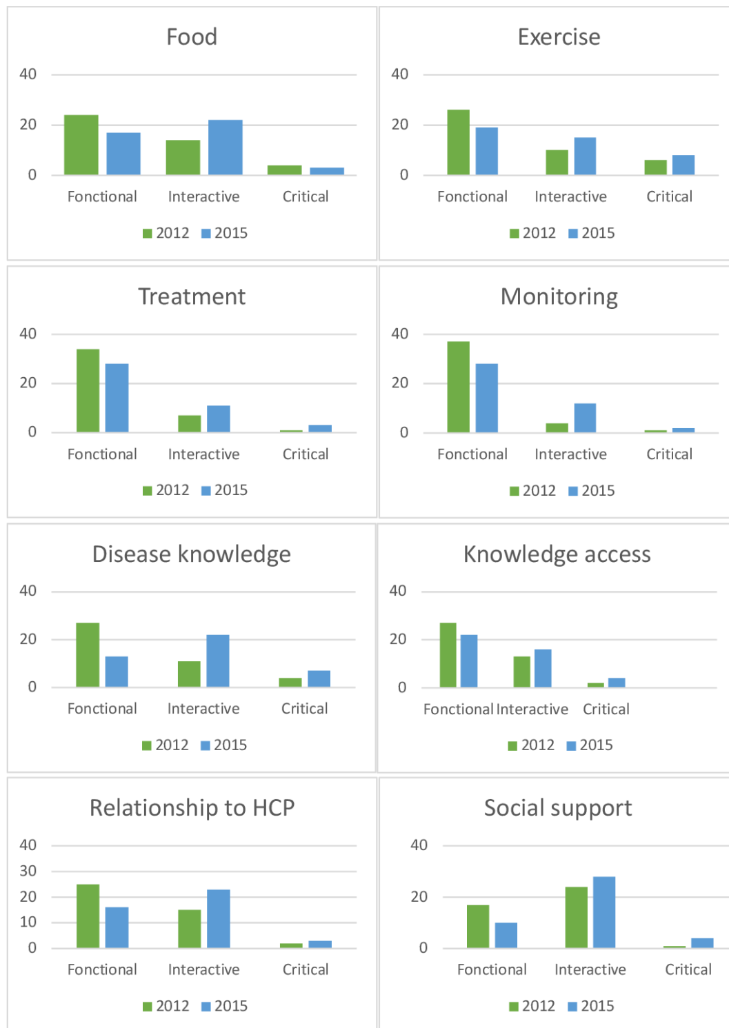
Figure 2 Number of patients with functional, interactive and critical relationships to the eight themes of disease management in 2012 (first-round interviews) and 2015 (second round interviews). Ermies ethnoscio study, qualitative thematic analysis of interviews, n=42 participants. HCP, healthcare provider.

In this study, a fine qualitative approach of disease management analysed through the theoretical lens of the Nutbeam's HL scheme yielded useful insights for a comprehensive description of strengths and weaknesses at the individual and contextual level for people struggling with disease management. 25 The HLQ was used as a complement to describe the HL needs expressed