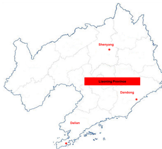
Figure 1 Location of the three study cities in Liaoning Province.

The inclusion criteria were as follows: (1) patients aged >18 years old; (2) patients who have lived in Shenyang, Dalian or Dandong for at least 5 years; (3) participation