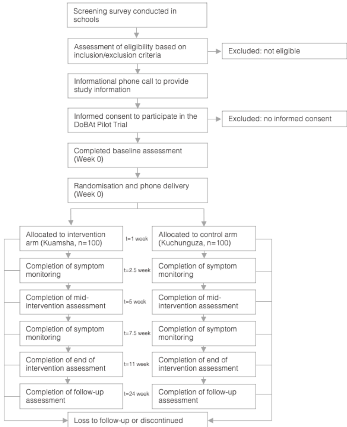
Figure 1 CONSORT Flow Diagram for the DoBAAt Study.

text message to the study phones. The socioeconomic outcomes will be assessed by blinded outcomes assessors. Table 2 indicates the time schedule of enrolment, interventions and assessments for participants, and figure 1 shows the flow of participants.