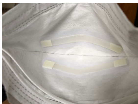
Figure 1 Two polyvinyl alcohol test strips adhered to the inside of a face mask.

The overall aim of this study is to analyse transmission clusters of SARS-CoV-2 in communities and identify factors