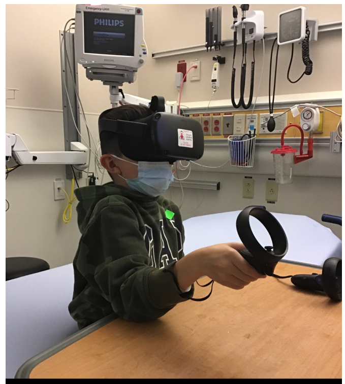
Figure 1 Child using virtual reality goggles in the emergency department.