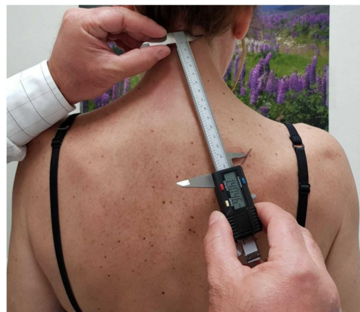
Figure 3 Levator scapulae length measurement.

The SPADI was assessed in all participants. The SPADI is composed of 13 questions and contains two domains: pain and disability. The score of the questionnaire ranges from 0 to 100, with very high scores indicating worse function. The numeric pain scale runs from 0 to 10, with 0 indicating no pain and 10 representing the worst pain. 30 The SPADI has shown a good internal consistency with a Cronbach's alpha of 0.95 for the total score, 0.92 for the pain subscale and 0.93 for the disability subscale as