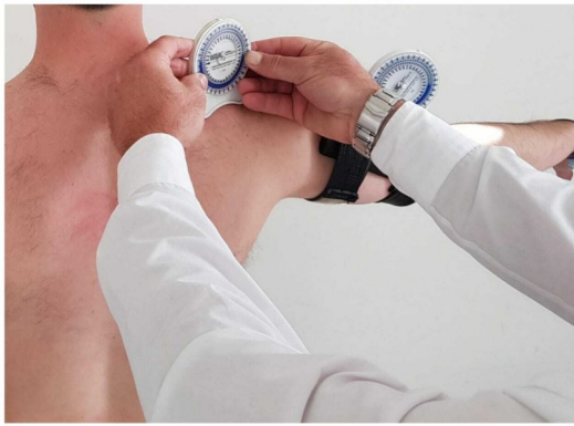
Figure 1 Scapular upward rotation measurement.