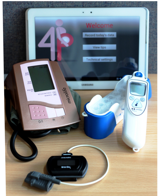
Figure 1 Equipment used for vital sign data collection.

In addition, relevant medical and obstetric history will be extracted from the participants' notes to support analysis of the data. We will collect demographic information (age, height, weight, ethnicity, number of previous pregnancies, smoking status), medical and obstetric history, current health status, pregnancy-related health