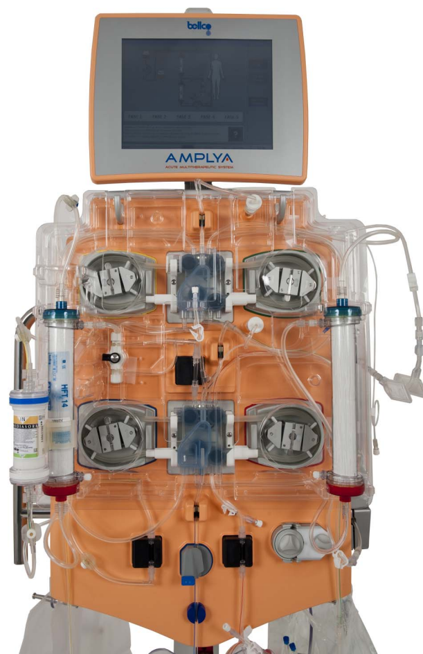
Figure 1 AMPLYA system from Bellco Societa unipersonales a r.l. The resin cartridge and plasma filter are in position and ready for use. The copyright holder (Bellco) has approved the usage of this figure.

CPFA was first used in the late 1990s with subsequent publications of several small observational clinical reports and case studies. 20–26 A few years ago, a large randomised multicentre controlled trial was performed by a group of Italian intensive care physicians, GiViTI, but the trial was stopped for futility. 27 Factors leading to early stopping were extensively analysed by the investigators and focused primarily on technical problems and the inability to achieve an appropriate dose of treated